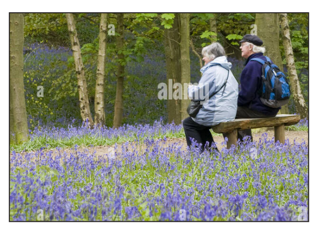
Future bulb planting projects...