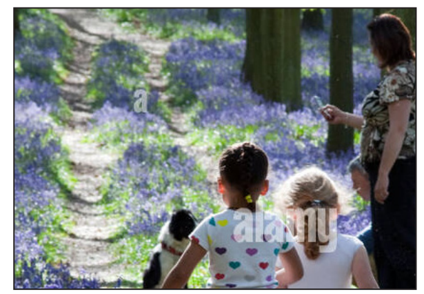
Multiple, wide routes through the space.