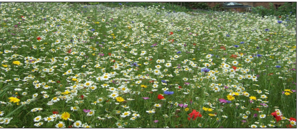
Reinvigorated wildflower area.