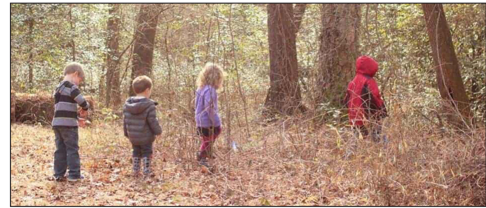
Local community and school asset