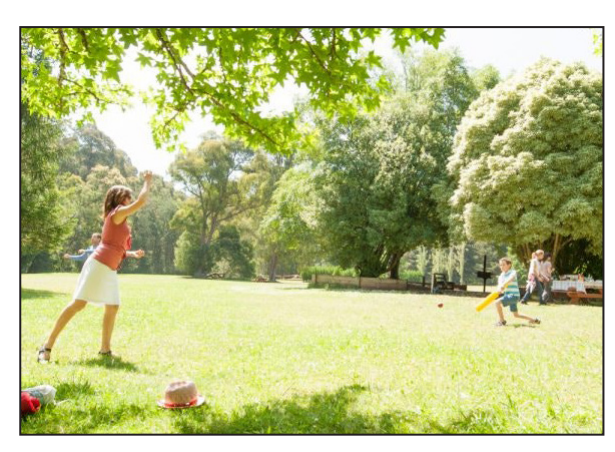
Glade area to relax, play and contemplate.