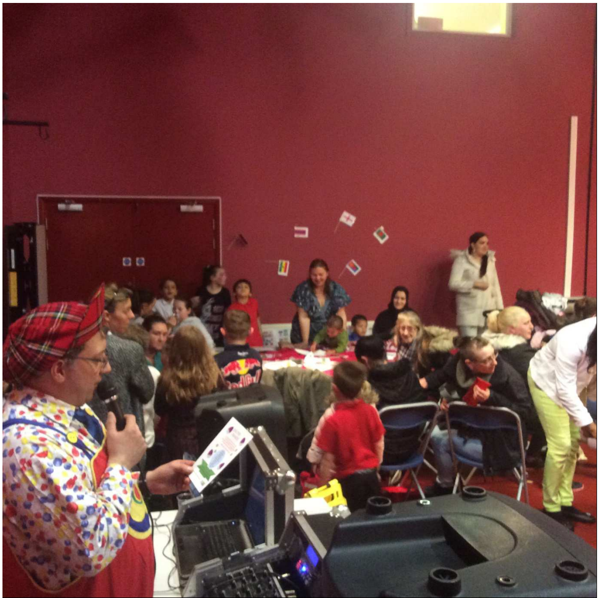
World Food Day at Minver Crescent Sports Centre bringing people together from different communities to taste each other's food - sponsored by Aspley councillors