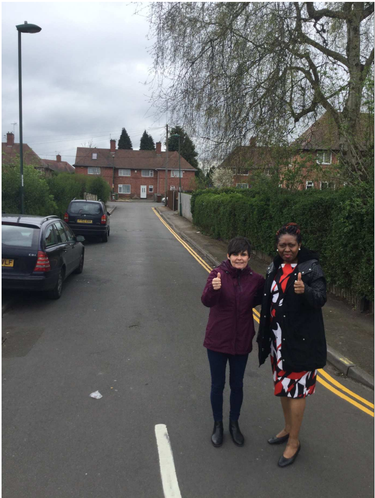
Aspley Councillors getting double yellow lines painted in closes where parking on both sides of the entry create blockages for emergency vehicles and bin lorries. It also frees up one pavement for buggies and wheelchairs