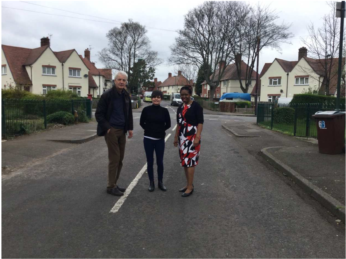
Aspley councillors in front of newly clad and insulated homes Junction Hilcot Drive/Shepton Crescent