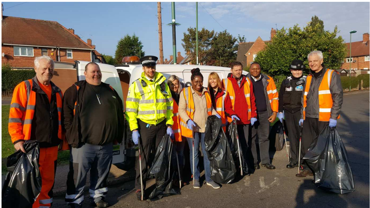
Councillors with local area team ready for a clean-up and litter pick in the Aspley/Broxtowe/Bell's Lane area