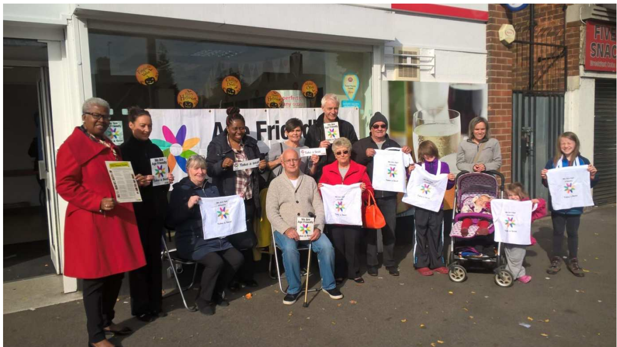
The 'Take a Seat' campaign which encourages local shops to provide seating for anyone who is infirm