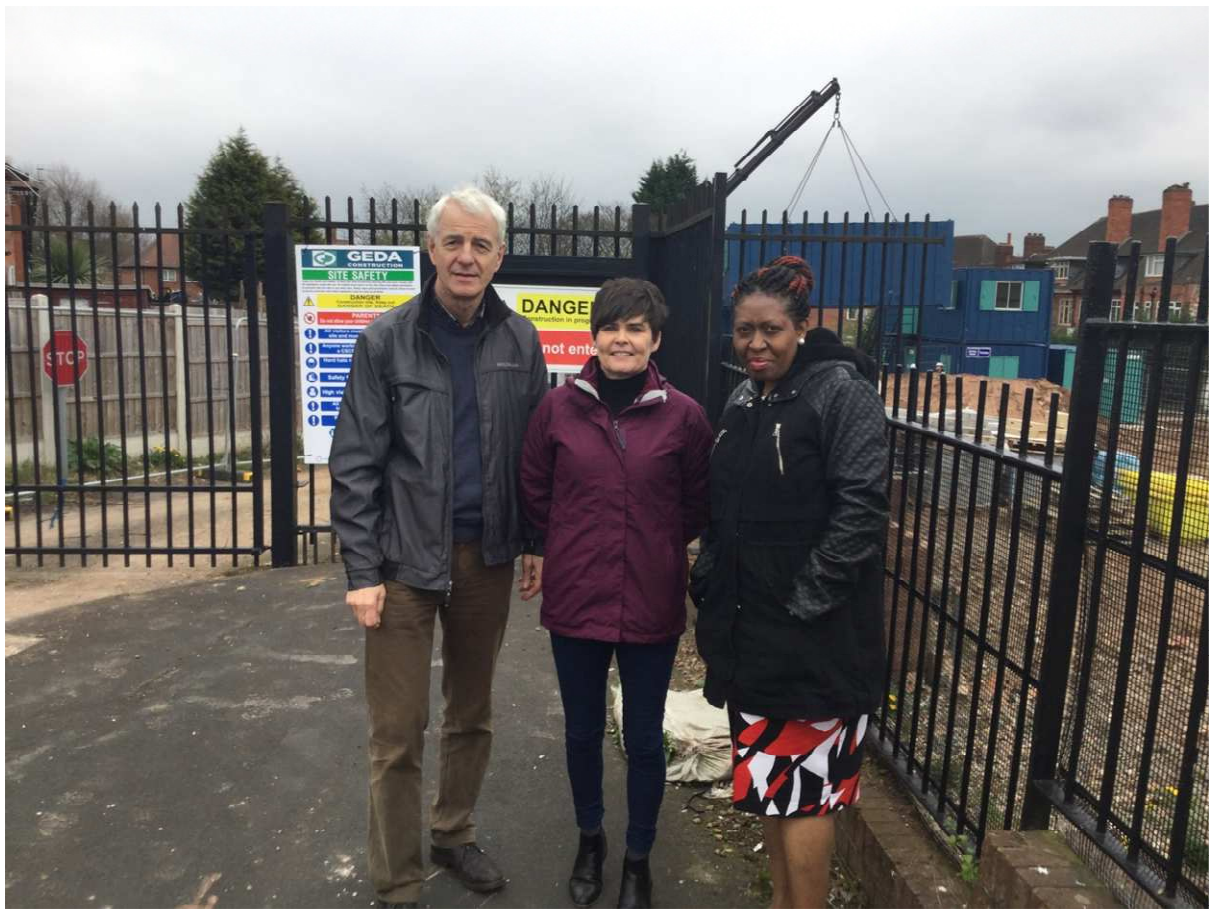
Aspley Councillors on the site of the new Strelley Road complex providing 30 homes for elderly people and a new library