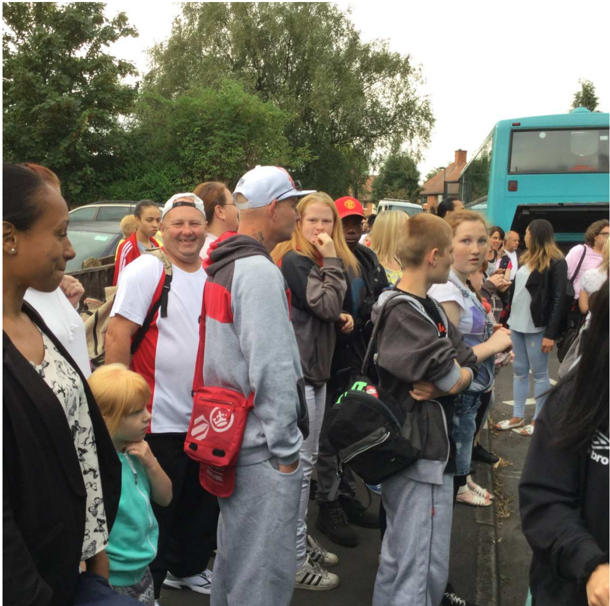
Local residents on a 'get to know your community' outing to Skegness part funded from local councillor budgets