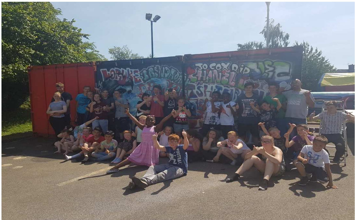
Part of the nationwide celebrations at the Phoenix Adventure playground funded by Aspley Councillors budget to commemorate Jo Cox MP who was brutally murdered as she left her weekly surgery.