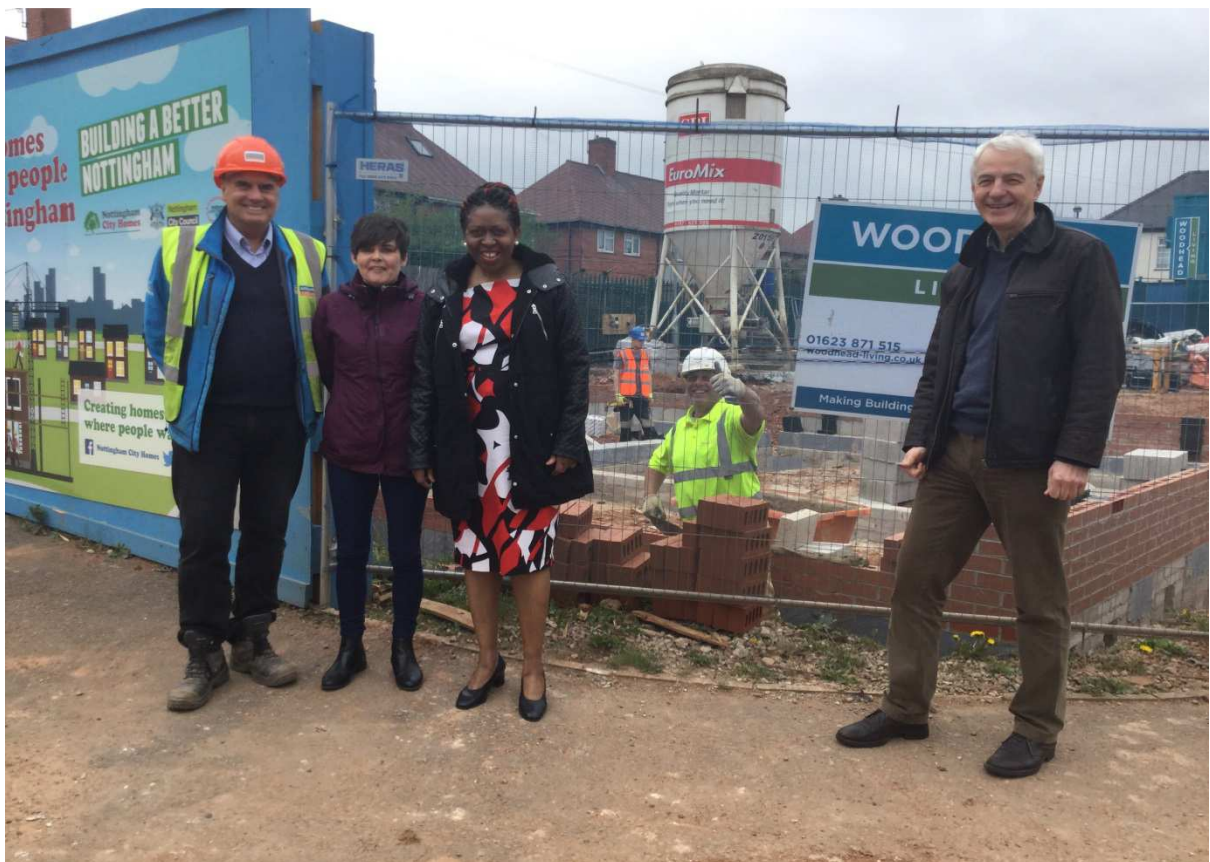
Aspley Councillors on the site of the new bungalows being built on Oakford Close to house the elderly and free up homes for families