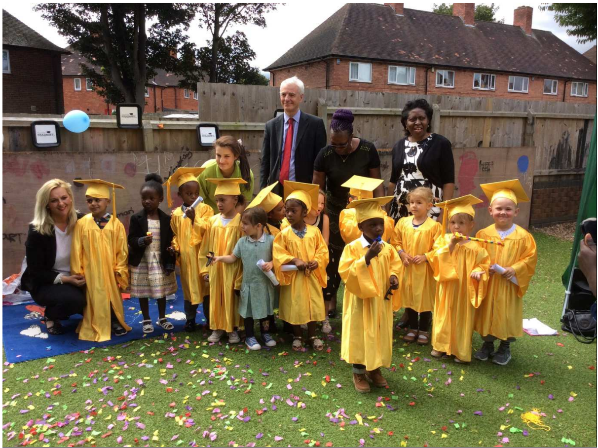
'Graduation' at Tic Toc Nursery, established with the help of Councillors to provide for local children